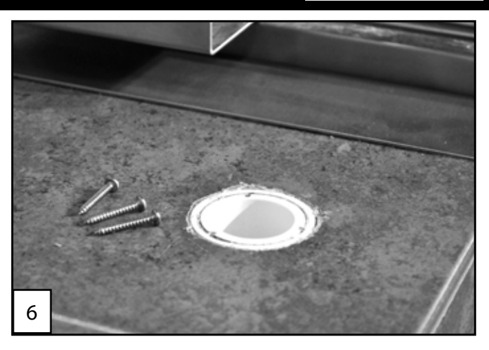
(6) After adhesive has completely cured remove the three #6 X 1" screws and washers. Keep screws for final assembly in step #8 and discard the washers..