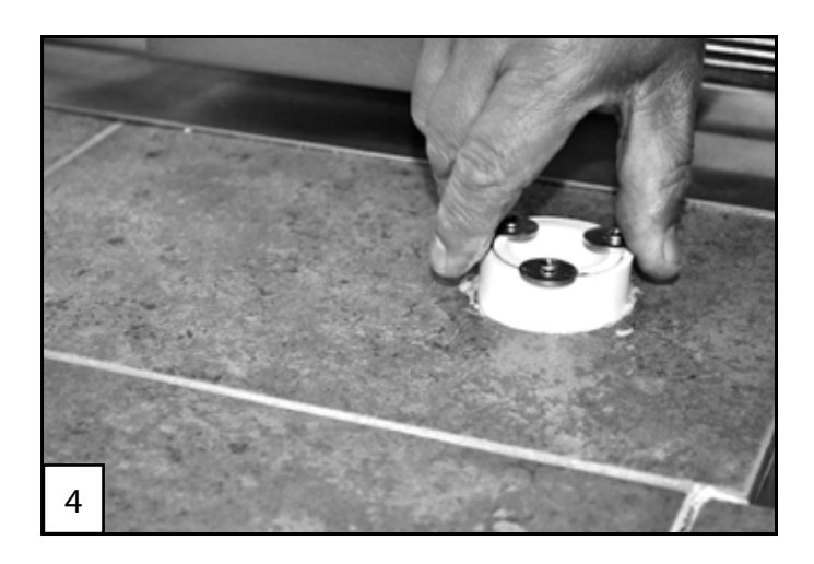
(4) Insert mounting sleeve into place. Rotate sleeve slightly to ensure even coverage of adhesive to sleeve. The washers will rest on the counter top holding the sleeve in place.

Note: Set a container under hole to catch excess adhesive.