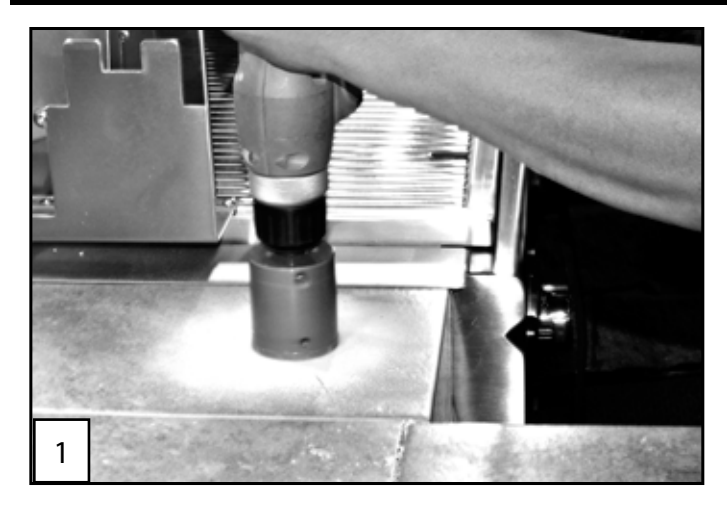
(1) Drill 2" hole through surface. A wet drill is recommended for hardscape installs. CAUTION: Make sure area underneath is clear of wire, conduit, gas lines, etc.

Note: Use a wood template to start core bit. A template will help the bit stay centered.