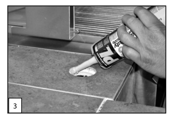
(3) Apply adhesive into hole. Make sure the adhesive is applied to the entire wall of the hole.

Note: Set a container under hole to catch excess adhesive.