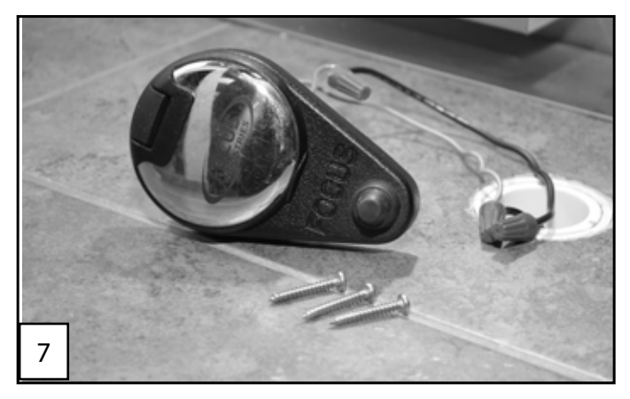
(7) Feed lead wire through mounting sleeve and make connection to 12v power supply.