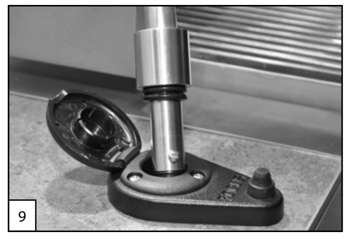
(9) Insert Quick Connect BBQ fixture into base with set screw facing towards front of counter. Press fixture firmly into place. Turn on power and check for proper operation.