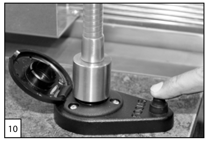
(10) When fixture is in use, the On/Off switch can be used to turn off light without removing fixture. When not in use, pull fixture straight out of base and close cover. Fixture should be stored in a dry area.