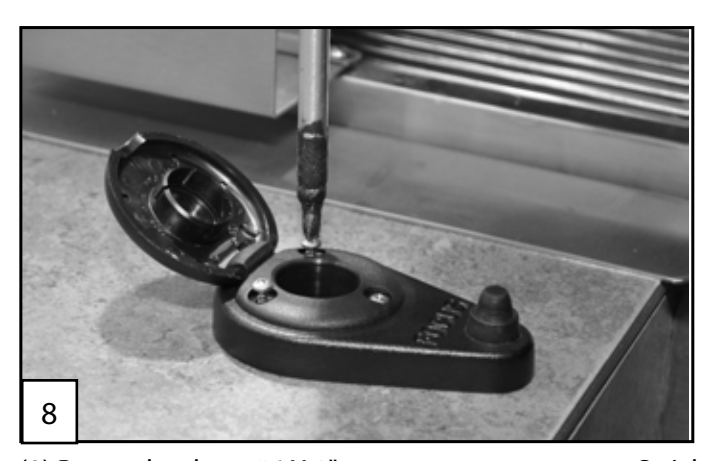
(8) Reuse the three #6 X 1" set up screws to mount Quick Connect Base into mounting sleeve.